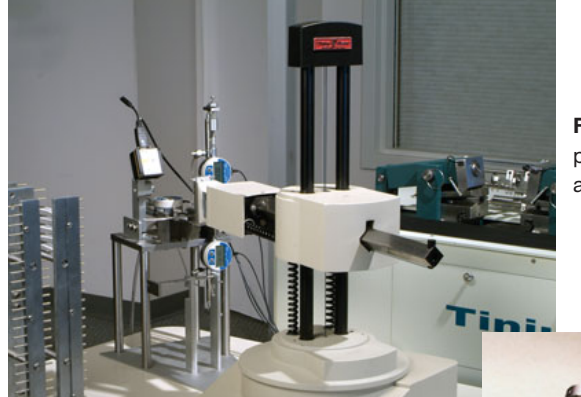
Fig. 5. Close up of pick-and-place robot and sample racks