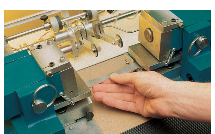
Fig. 3. Close up of unique extensometer that can stay on to sample fracture. The sample is loaded against the mechanical stops and the test started — the rest is automatic

data that is generated can be included into corporate manufacturing and resource planning software ensuring that quality control data is an integral part of operations.